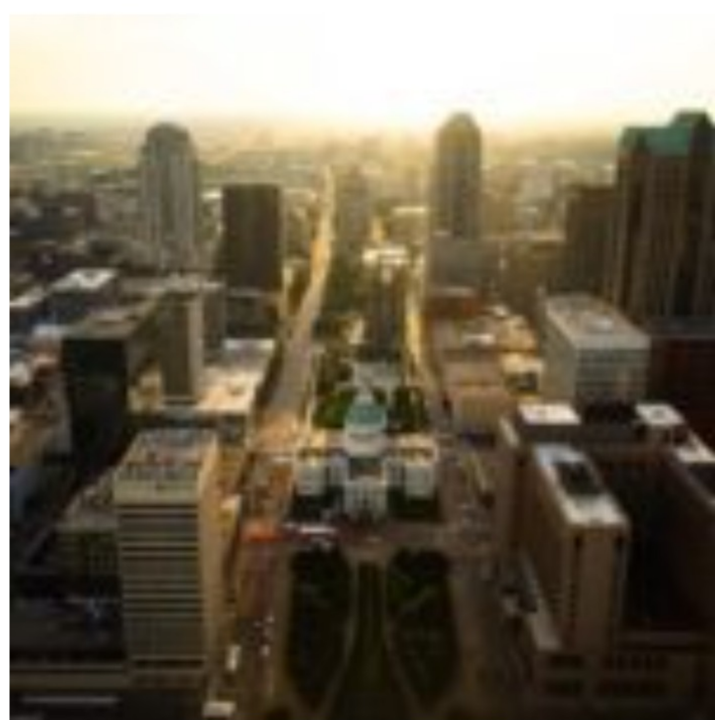
Addiction Treatment In Columbus, Ohio