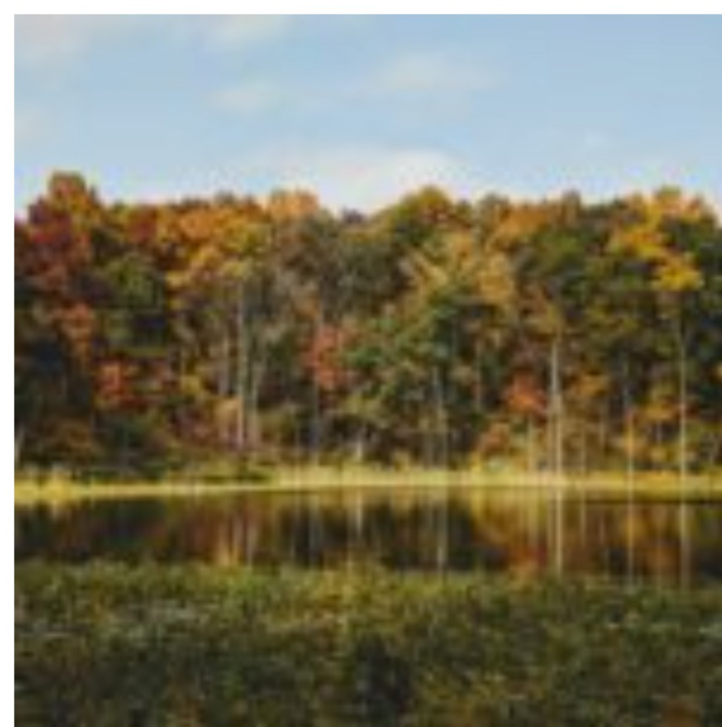
Addiction Treatment In Nashville, Tennessee

If you're a resident of Maine looking for addiction treatment in Kentucky, look no further than the Robert Alexander Center for Recovery. Give us a call today to talk to someone who understands what you're going through.