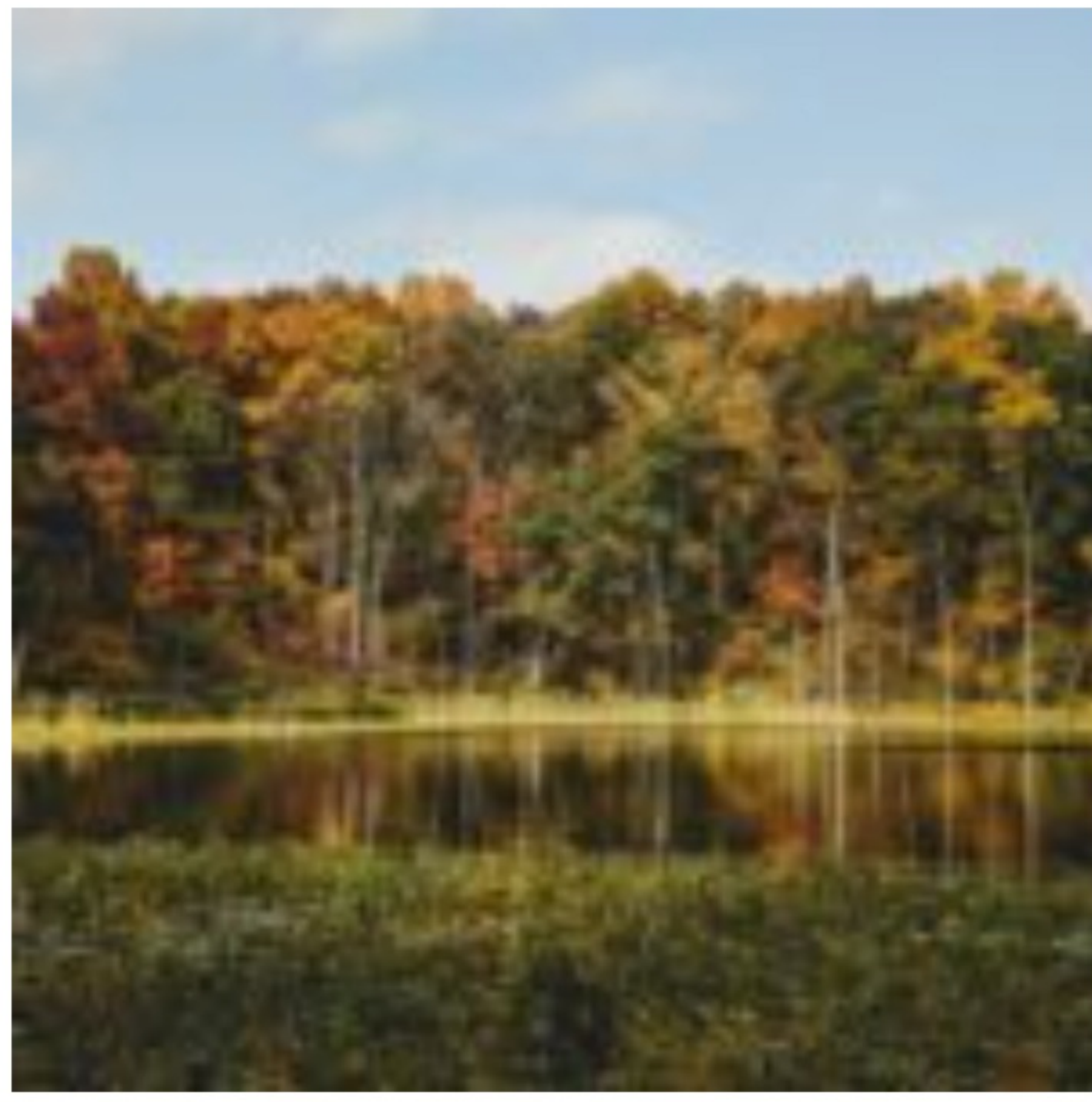
Addiction Treatment In Nashville, Tennessee

It is a big step to contact us today and get your rehabilitation space booked, but it's one that you will forever thank yourself for. It's time that you stopped focusing on other people and started focusing on detoxing and getting through the recovery process. You deserve to take a moment and realize that your health is more important than the next fix, and you need to stop hiding from all of the dark places and bring them out into the open. Contact us now and let's get you well.