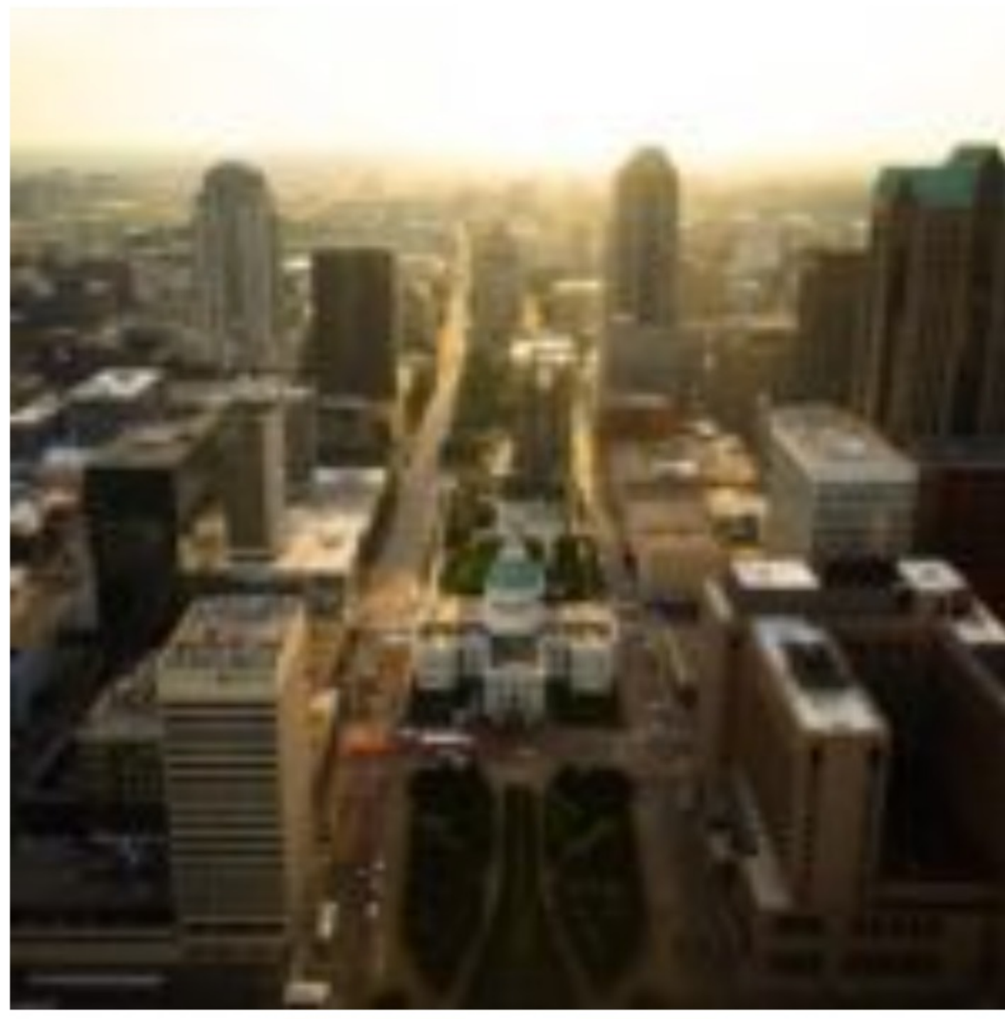
Addiction Treatment In Columbus, Ohio