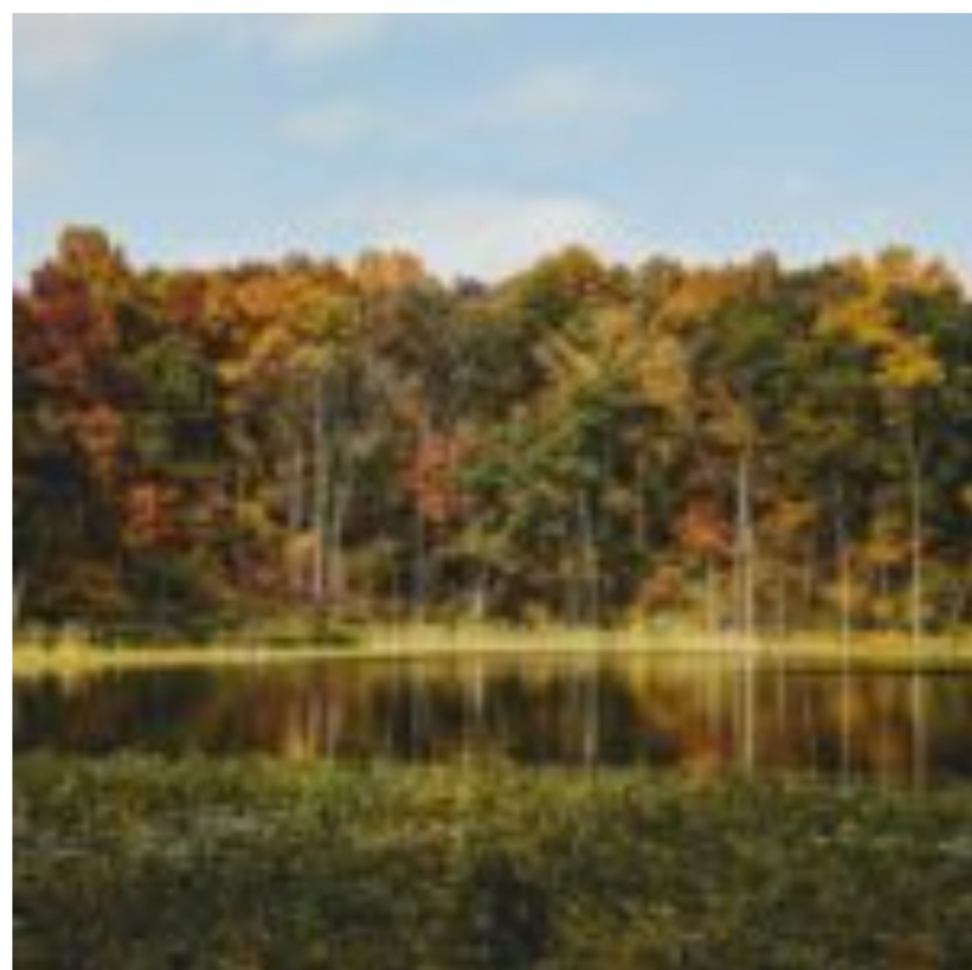
Addiction Treatment In Nashville, Tennessee

Whether you are staying with us, or non-residential , you will still be able to enjoy our clean and beautiful facilities to support you at whatever stage you're at in your recovery.