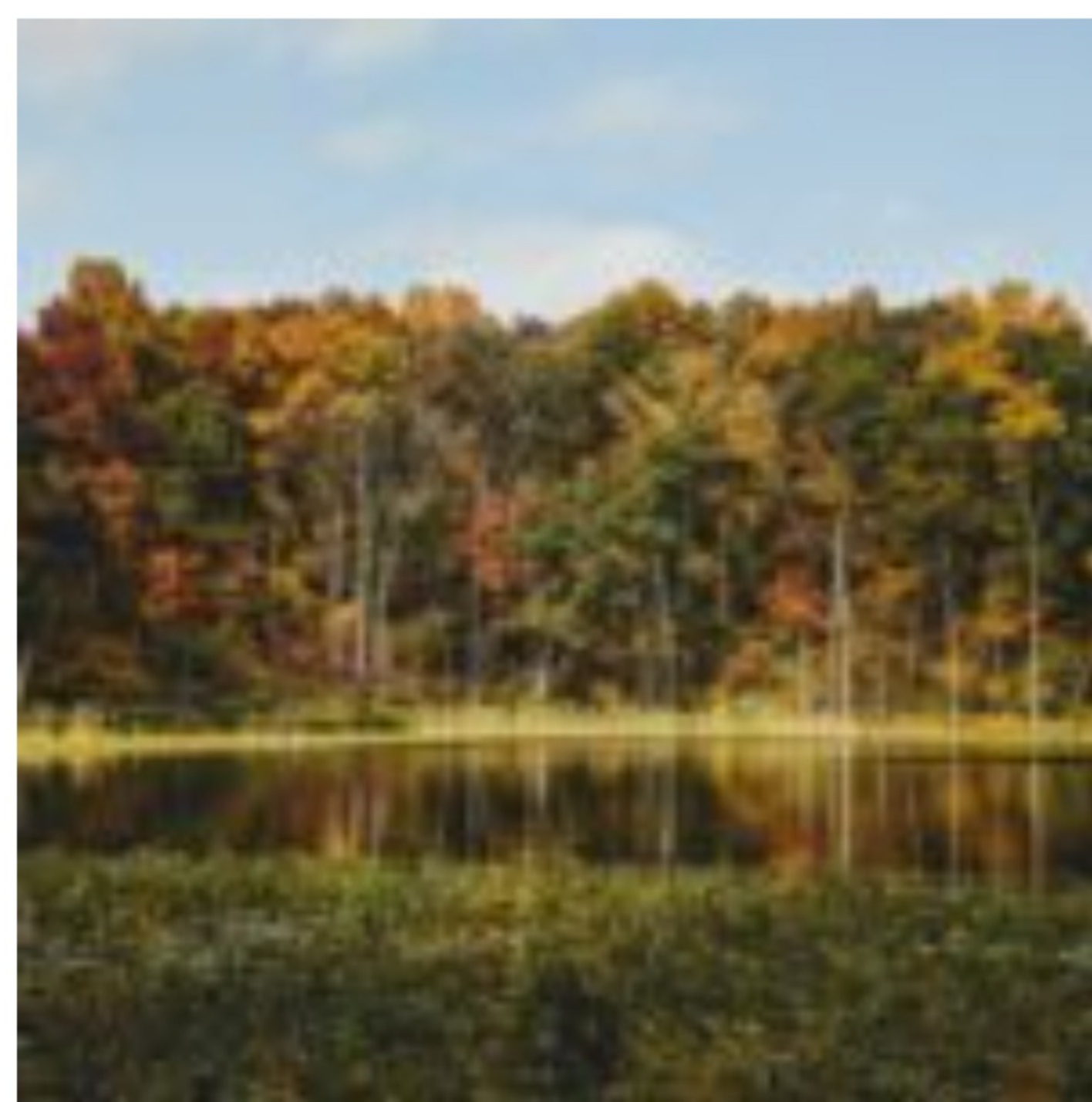
Addiction Treatment In Nashville, Tennessee

A patient from any background deserves to feel strong and supported, and those who spend their lives facing the stress of holding other lives in their hand? They deserve it, too. Contacting Robert Alexander Addiction Treatment Center professionals today is the smartest thing that you can do to get back to yourself once again.