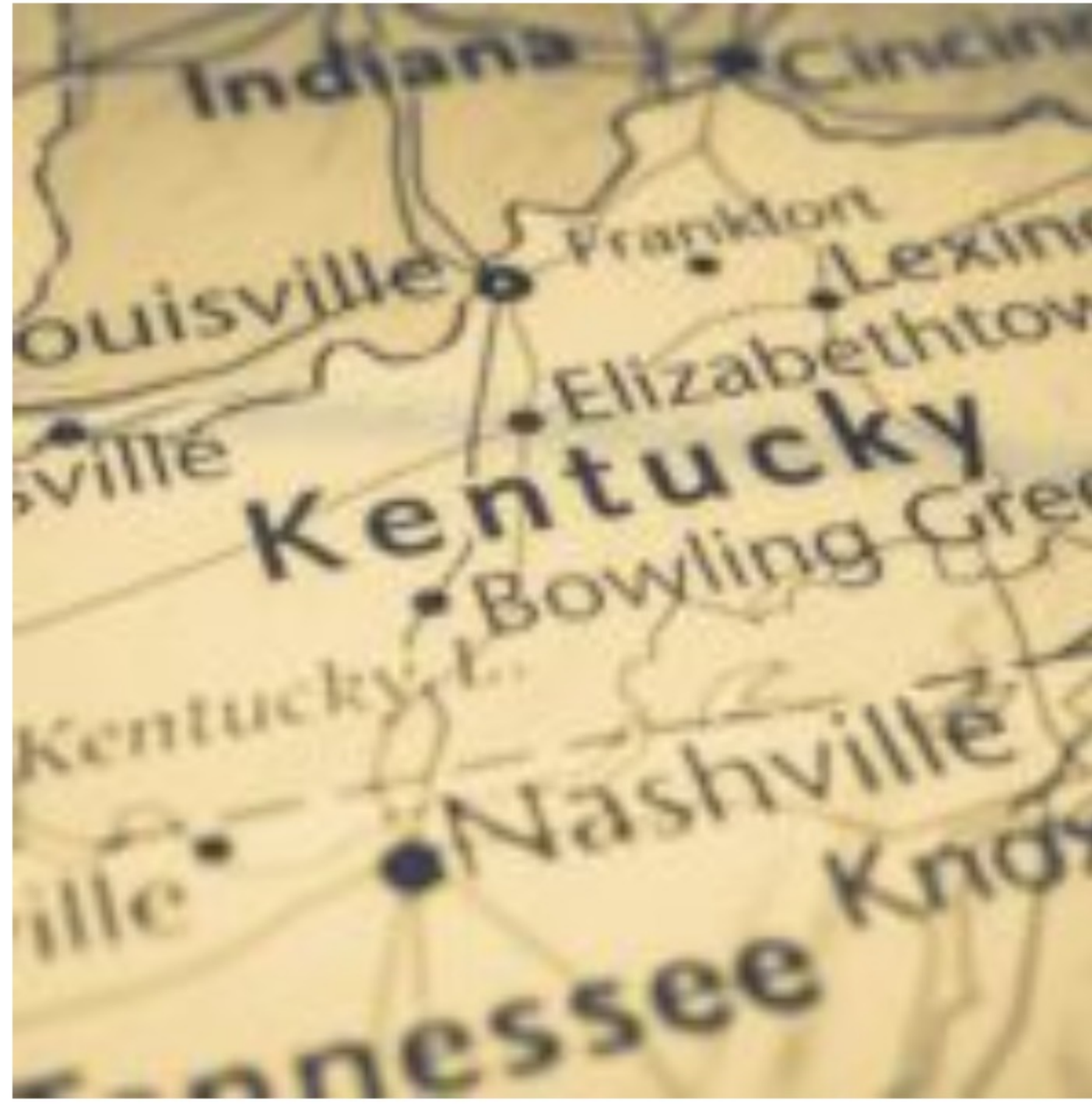
How to Find Alcohol Detox Programs in Kentucky