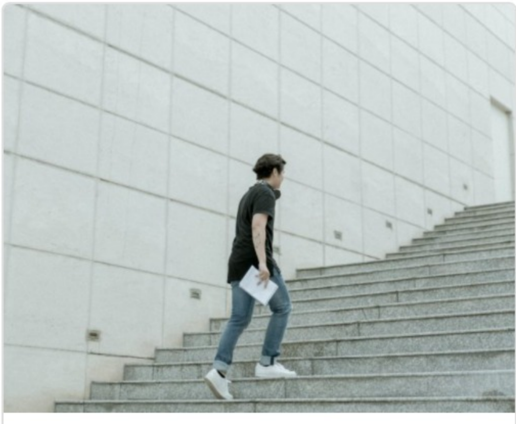
What is the 12 Step Addiction Treatment Process?